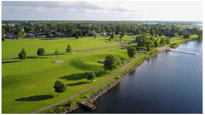
Morrisburg waterfront path – proposed location of the Morrisburg Model Village.

An ancillary benefit is the potential to apply the concept in the other Upper Canada Region communities affected by the St. Lawrence Seaway Construction.